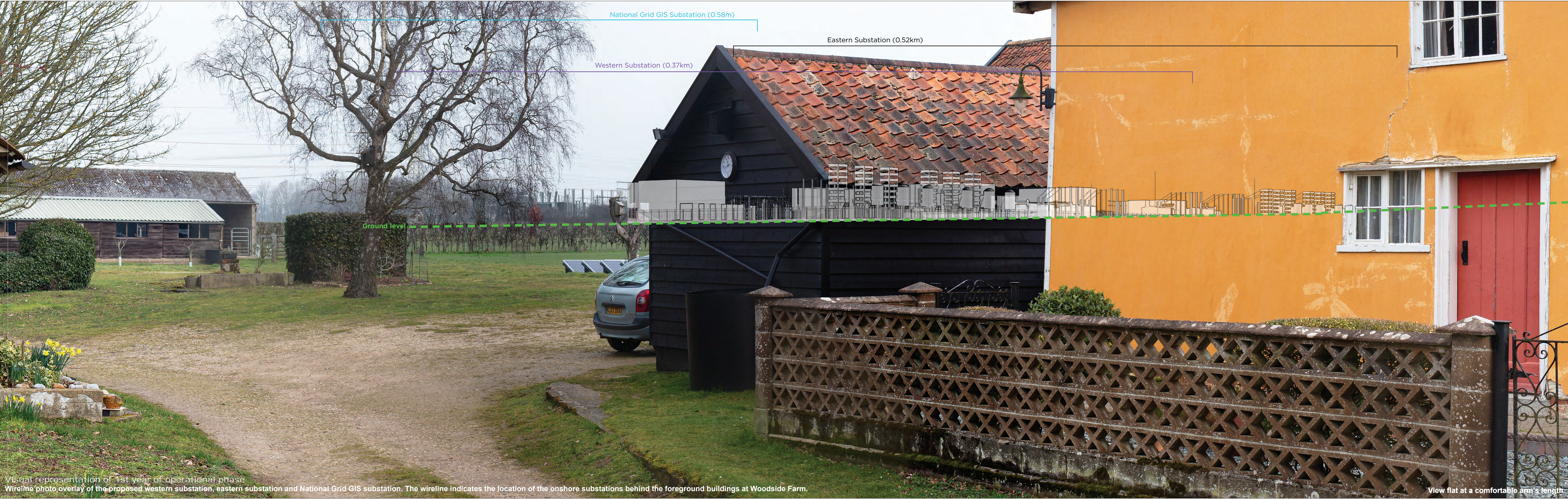
Visual representation of 1st year of operational phase Wireline photo overlay of the proposed western substation, eastern substation and National Grid GIS substation. The wireline indicates the location of the onshore substations behind the foreground buildings at Woodside Farm.