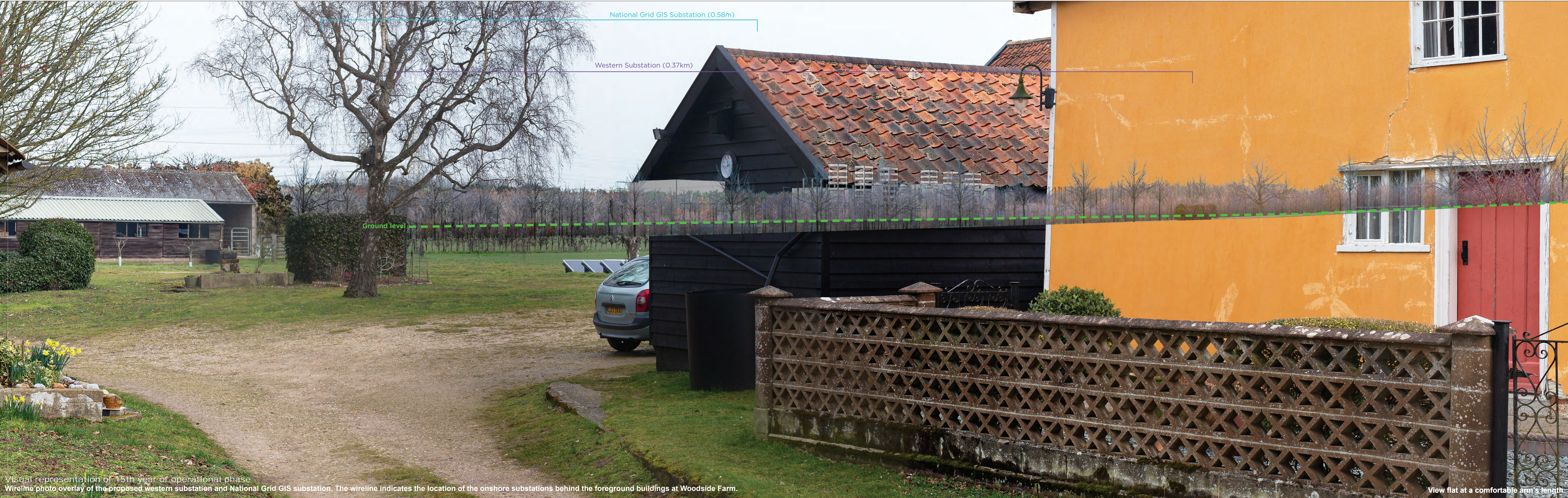
Visual representation of 15th year of operational phase Wireline photo overlay of the proposed western substation and National Grid GIS substation. The wireline indicates the location of the onshore substations behind the foreground buildings at Woodside Farm.