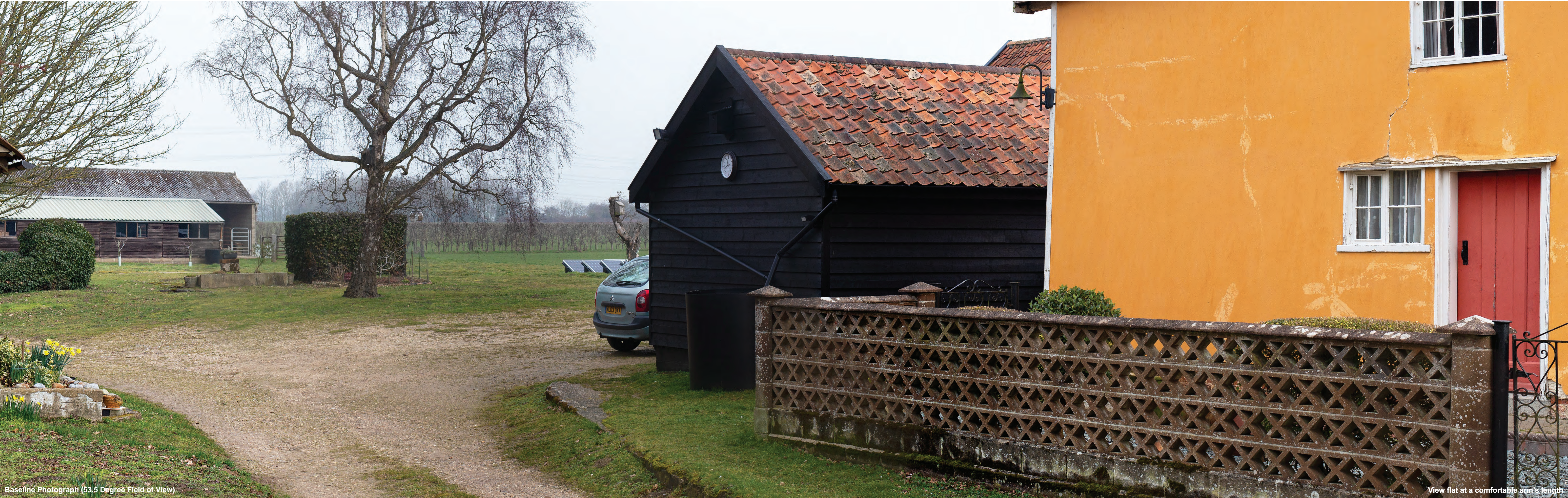
Baseline Photograph (53.5 Degree Field of View)