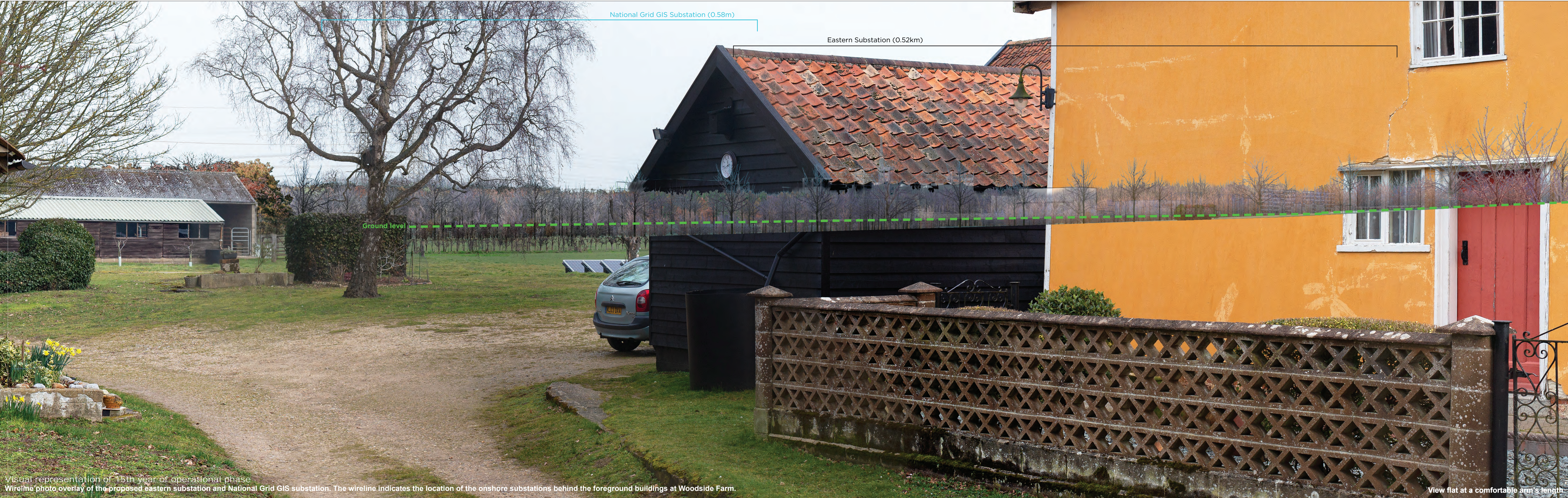
Visual representation of 15th year of operational phase Wireline photo overlay of the proposed eastern substation and National Grid GIS substation. The wireline indicates the location of the onshore substations behind the foreground buildings at Woodside Farm.